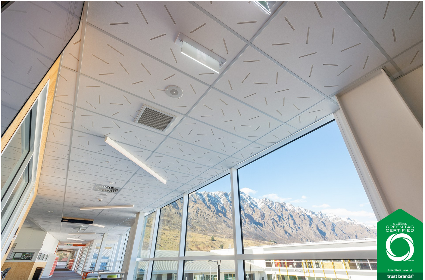
Photo: Wakatipu School, Triton 25, 600 x 1200 with Sonaris random slot perforated finish